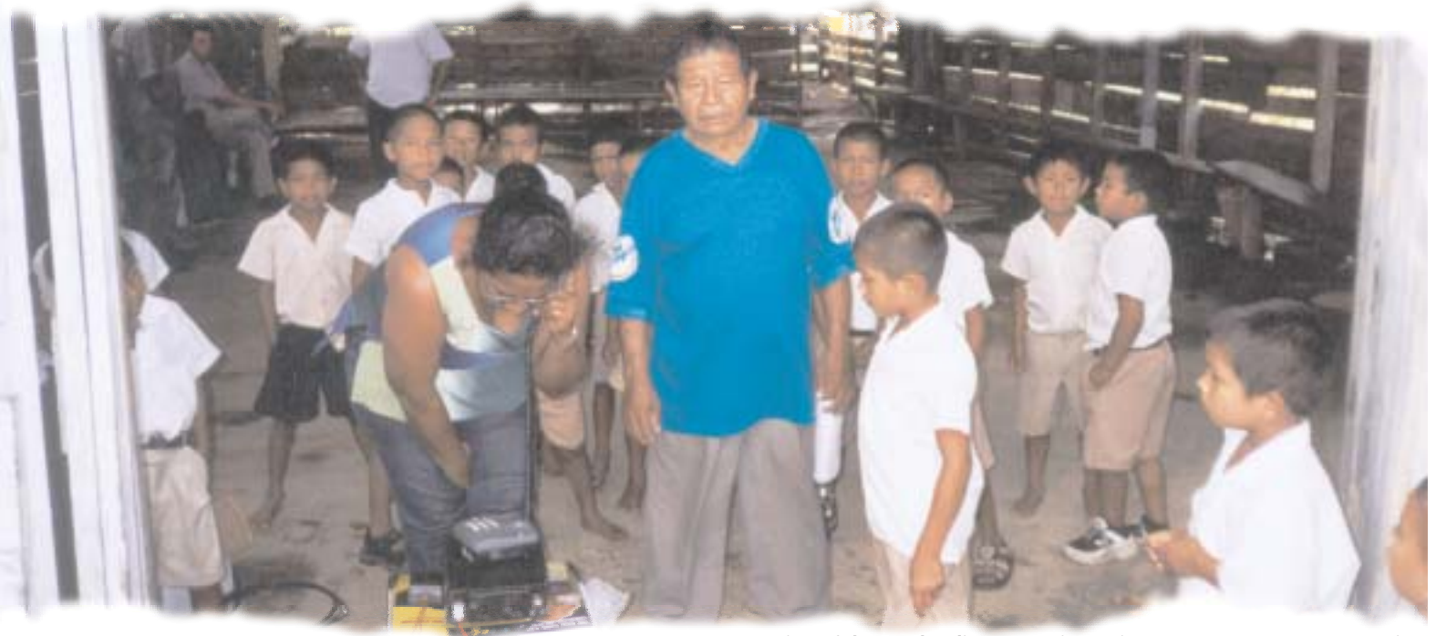
Testing of the rural radio system in Muritaro area, Upper Demerara River.