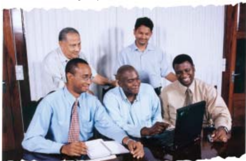
Finding the solutions.