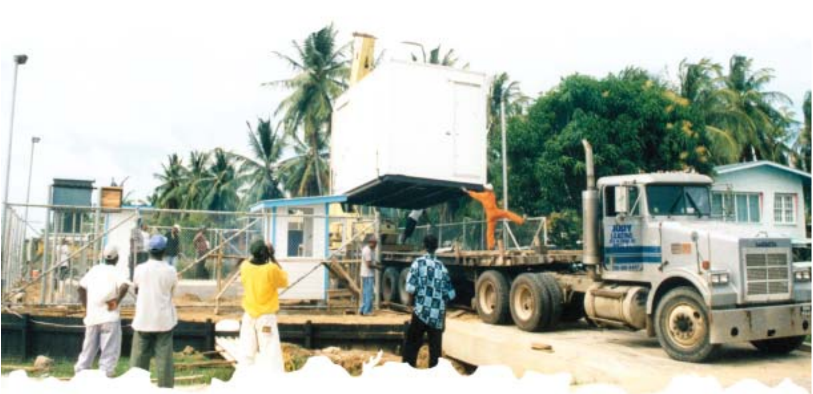
Installing a Container Exchange in Kilcoy, Berbice

income Guyana, with a per capita GDP of US$750, sufficiently poor to qualify for multilateral development assistance under the so-called Highly Indebted Poor Country (HIPC) initiative, has a household telephone penetration in excess of 40 percent. In other words, our telephone penetration exceeds that of Mexico (35 percent) which has a per capita GDP of US$4,500, Thailand (22 percent) which has a per capita GDP of US$1,950, and is virtually on par with that of Poland (42 percent) which has a per capita GDP of US$3,800.