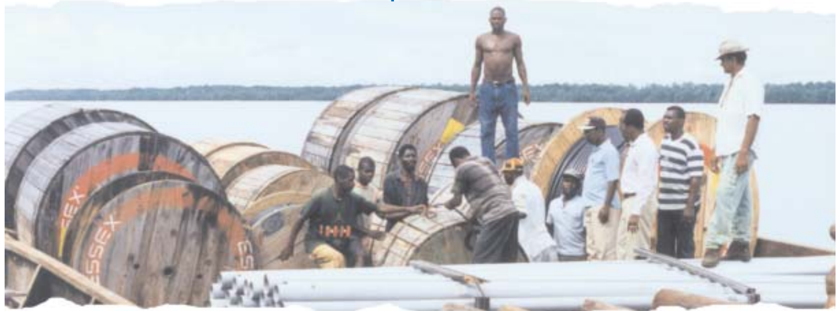
Loading up the cables and poles for a new exchange area

GT&T accepted a massive and unique challenge: to rehabilitate, modernize and expand Guyana's telecommunication facilities and services. To appreciate the scope of the undertaking requires an understanding of both the state of the facilities GT&T inherited and Guyana's geography.