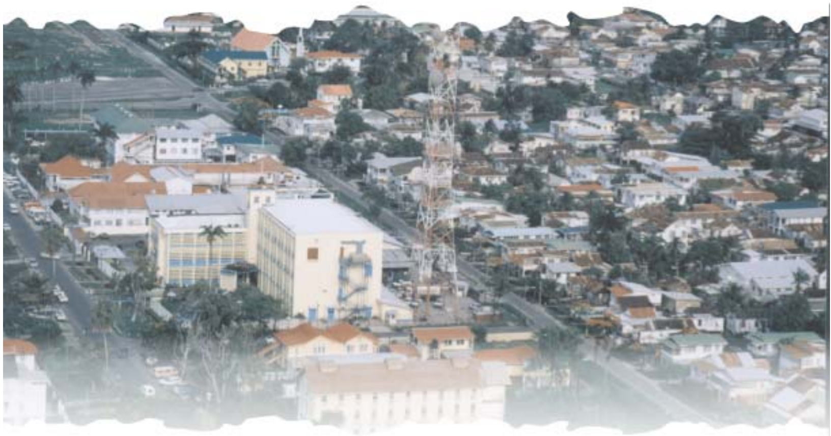
Aerial shot of Telephone House, Brickdam