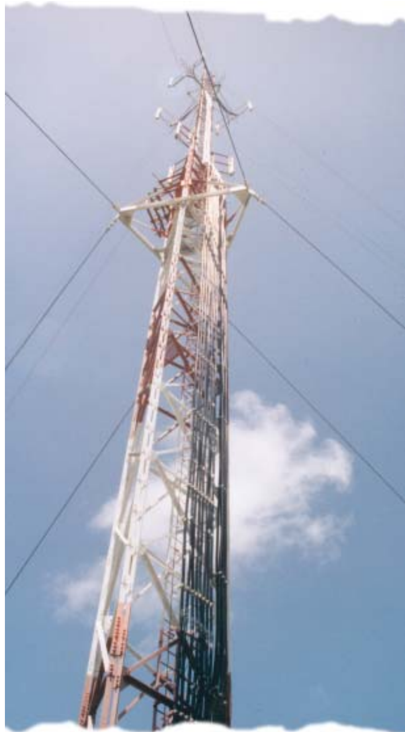
One of GT&T's countrywide cellular transmitting towers.

Regrettably, the policymakers in Guyana are yet to articulate a universal service policy and appropriate targets to guide its realization. Other low-income countries have done so. For example, in Kenya universal service has been defined as "a phone within walking distance," in Pakistan as "a phone in every village," in Zambia as "telephone booths in public places countrywide," in Brazil as "a telephone within less than five kilometers," and in South Africa as "a telephone within a thirty minute traveling distance."