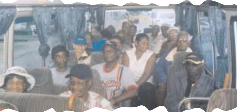
Respecting the past: Entertaining the pensioners who have laid the foundations.

Management recognizes that the company operates in a complex, fast-paced, and rapidly changing industry and that the critical skill sets the company requires are in high demand. For this reason, GT&T has sought to