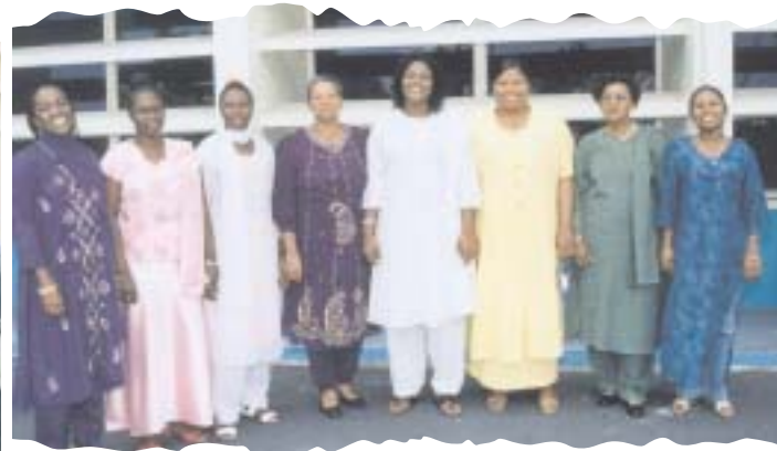
Observing the nation's ethnic diversity.

When GT&T began operations there were in excess of 50 expatriate staff occupying the key executive and technical positions. This was understandable since there was an urgent need to modernize the network, facilities and processes but, there existed a dearth of managerial and technical skills.