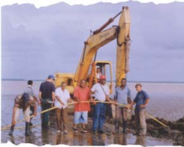
Launching Americas II in October 2002