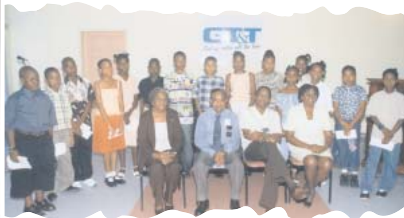
Investing the future...Presenting bursaries to children of the staff.