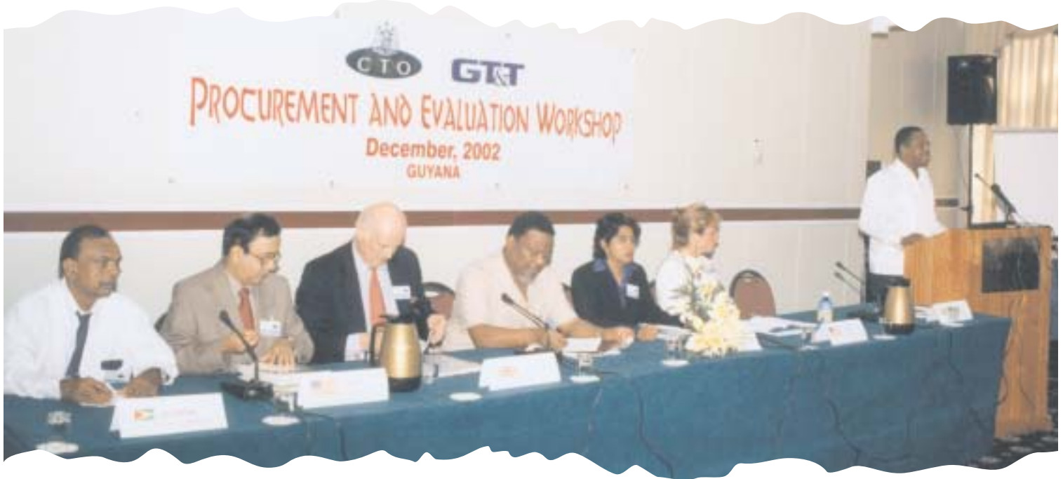
Hosting Commonwealth workshop.

Our commitment to improve the quality of our workforce continues to pay handsome dividends. Especially, it has created in the staff a facility with virtually any technology and has given them the confidence and the competence to fully utilize any state-of-the- art equipment for customer benefit.