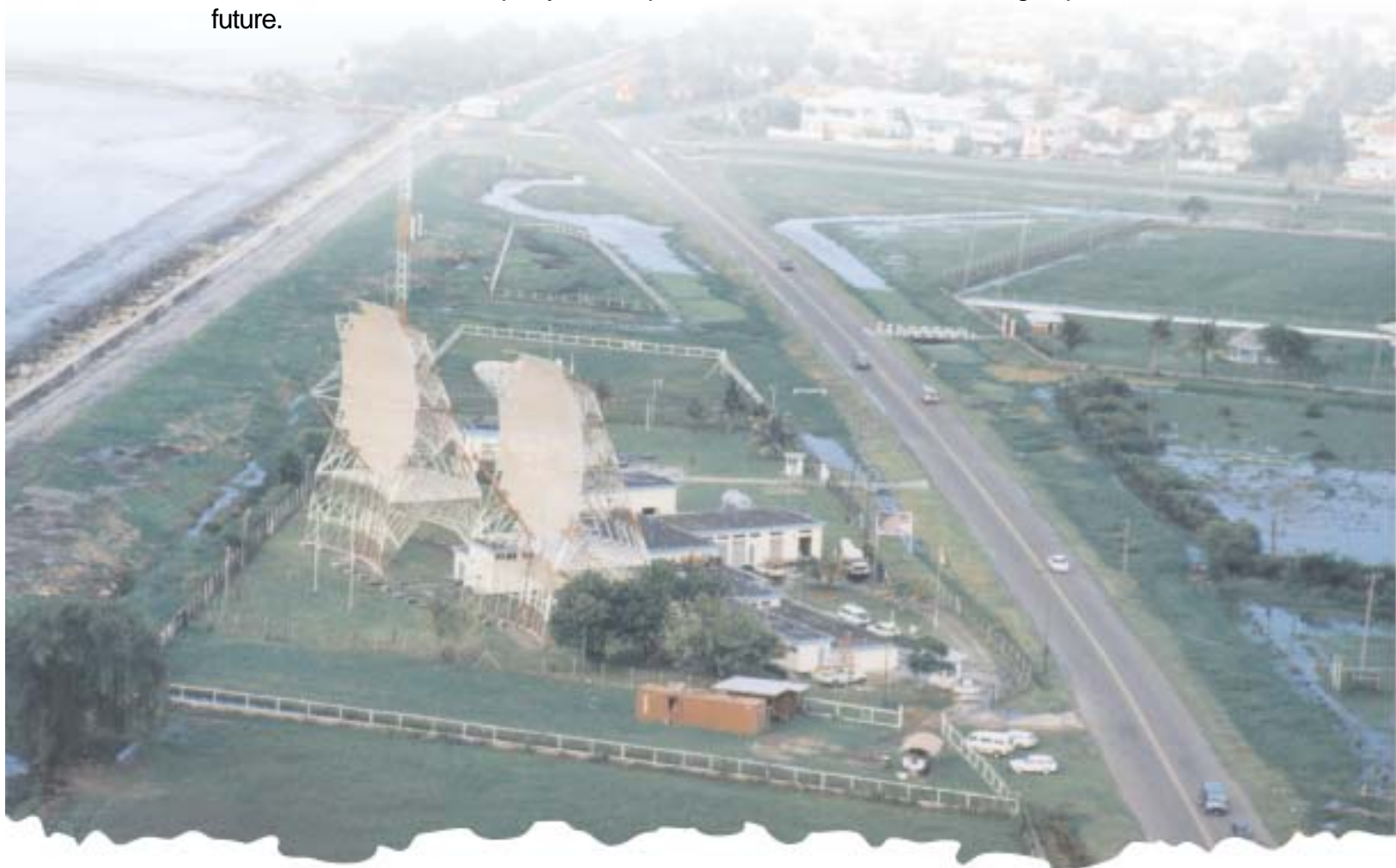
The Earth Station, nestled between the Atlantic Ocean and Carifesta Avenue, Georgetown

"Building Bridges, Linking Communities" puts into context the challenges and successes that the Company has experienced to date and offers a glimpse into the future.